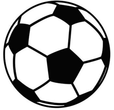
DESIGN A MATCH DAY BALL